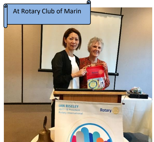
At Rotary Club of Marin