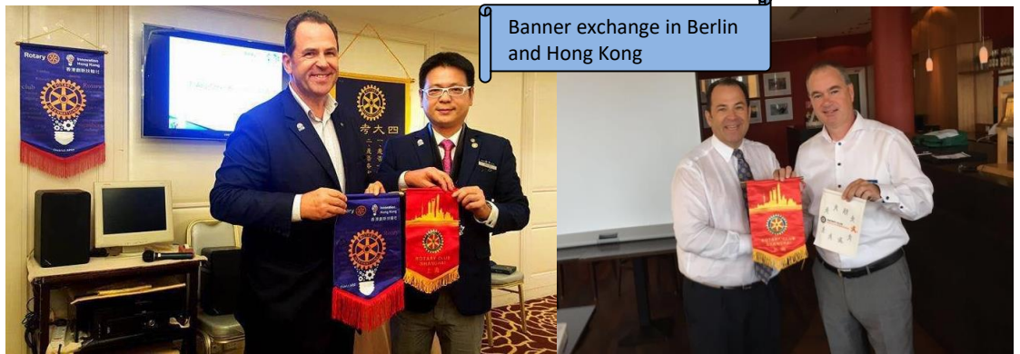
Banner exchange in Berlin and Hong Kong