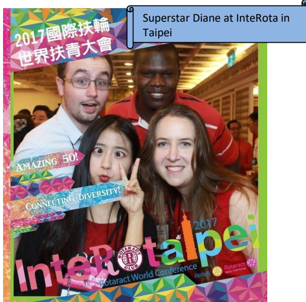
Superstar Diane at InteRota in Taipei